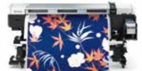
SC-F7270 64" Wide Roll-to-Roll Dye-Sub