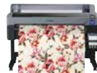
SC-F6330 44" Wide Dye-Sub